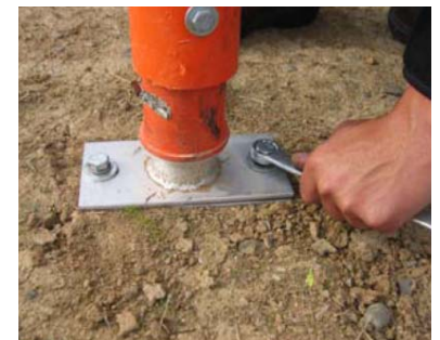
Step 3: Mount the post.