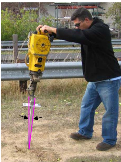
Step 1: Begin with the Anchor set at 10° angle.

Step 3 – Place the RubberTough® 360 post on the Anchor top plate and insert the two 1/2" bolts with flat and lock washers. Tighten snugly.