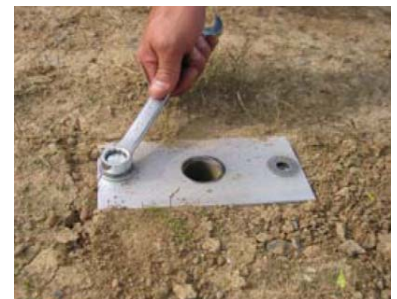
Step 2: Remove 1/2" bolts.