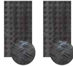
Use DuraDeck 1 & 4 for Vehicles (DuraDeck shown)