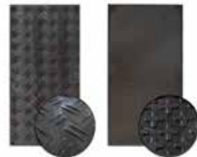
Use DuraDeck 2 & 3 for Vehicles/Pedestrians (DuraDeck 2 shown)