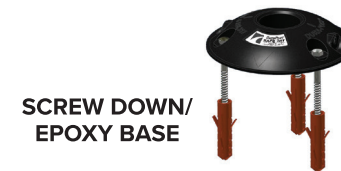
SCREW DOWN/ EPOXY BASE